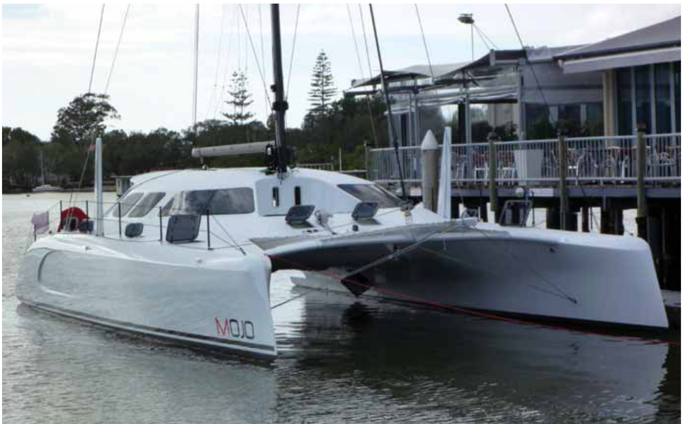
Mojo G-force 1500 Designed by Schionning Designs Built by Noosa Marine, Australia

After you are satisfied with the texture and fairness of the surface, rinse the surface with fresh water and dry it with clean paper towels. Proceed with your final coating operation, following the specific instructions of your paint or coating system supplier. It may be a good idea to make a test panel to determine required surface preparation and finish compatibility.