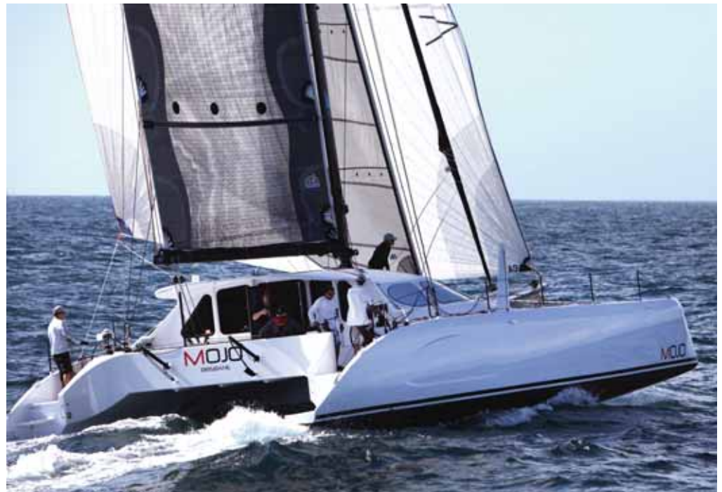
Mojo G-force 1500 Designed by Schionning Designs Built by Noosa Marine, Australia

Planks are manufactured in a controlled environment and under-go strict Quality Inspections, at all stages during the manufacturing process, to ensure dimensional stability and consistent thickness.